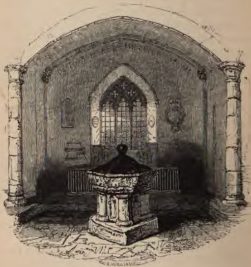
'A vault was opened for Wilberforce, under the chancel.'